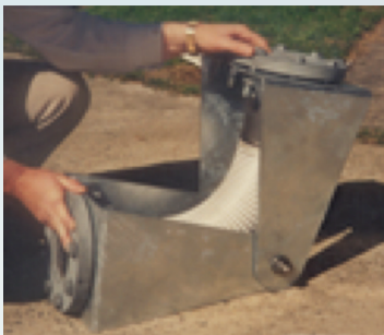
Flexible elbow with joints, in a floating roof oil tank

The following problems may occur in the operation of a floating roof drainage system: